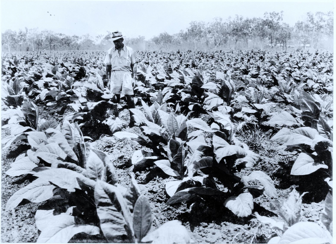
Tobacco Growing - Glare