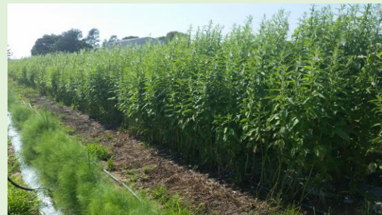
The fennel and black sesame crops in the 2019 small scale trials at Rita Island in the Burdekin.

Expressions of interest are now open for farmers in the Burdekin region who can provide up to one hectare of land to trial either fennel or black sesame. Please send your expressions of interest by email to mackenzie@bbifmac.org.au or phone the BBIFMAC office on (07) 4783 4344.