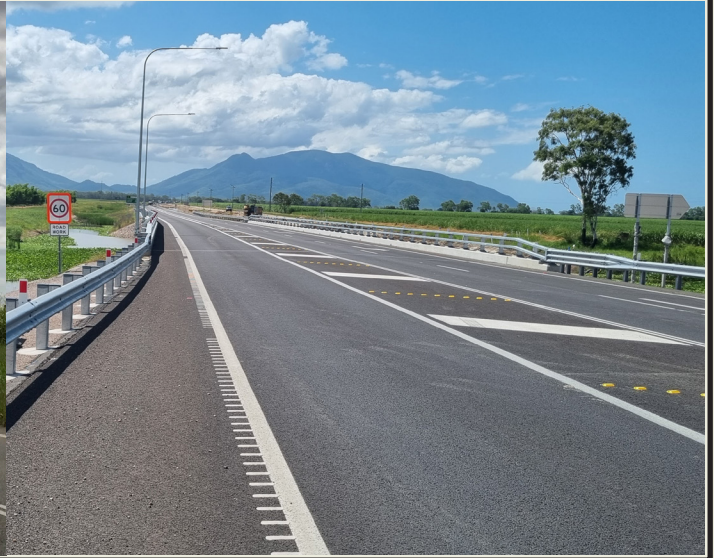
Woodstock Giru Road intersection