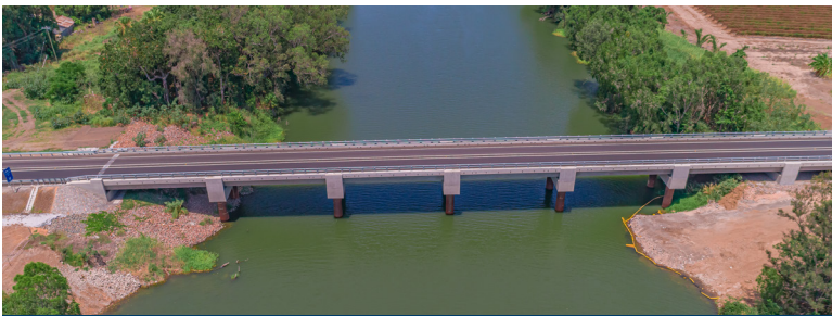
Demolition of the existing Haughton River bridge is now complete. As is demolition of the existing Horseshoe Lagoon and Pink Lily Lagoon bridges.

The Department of Transport and Main Roads' (TMR) plans to complete the Haughton River Floodplain Upgrade project in late 2021 have been impacted by ongoing wet weather.