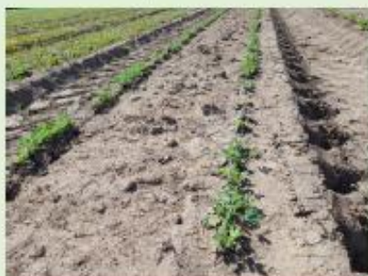
Emergence of the peanut crop in Home Hill.

A new project led by Central Queensland University (CQU), with funding from the CRC for Northern Australia (CRCNA) is the Grain and Graze: Dual purpose peanuts for Northern Australia. This project will assess new peanut varieties as dual purpose crops for kernel yield in combination with different fodder production options in five locations across Northern Australia. Locally, BBIFMAC are assisting with a small plot trial of three varieties in Home Hill.