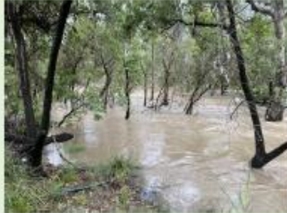
BBIFMAC staff collected manual samples to compare with the in-situ sensors at many of the Fine Scale sites during the recent rainfall. This image is of the Cassidy Creek site.

A meeting with stakeholders in the Burdekin is planned for early 2022 to discuss the improvements made to the app and the water quality results to date.