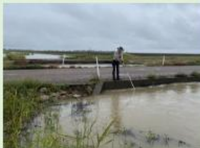
Arwen taking a velocity reading at one of the drainage systems during the recent high rainfall period.

In the latter part of 2021, BBIFMAC began undertaking baseline monitoring at three drainage systems in the region to assist Greening Australia with determining site suitability for transition to Constructed Wetland Treatment Systems. An additional three sites have been added to the list of prospective locations and monitoring is underway.