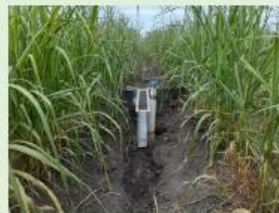
Flumes and water depth loggers have been installed at each of the four sites to determine the proportion of water lost to runoff in irrigations.

BBIFMAC have been engaged as an independent organisation to undertake the water quality monitoring for the project. There are currently four sites with which BBIFMAC are involved.