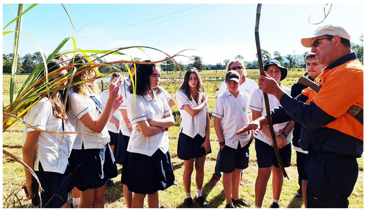
SIPP visit for SRA Woodford

Above: Rocky Point growers investigate a weed identification app available on a smartphone, during the workshop.