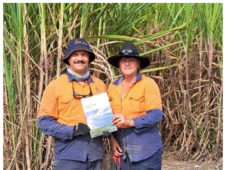
Field Days + Variety Guides = busy fortnight!

It's that time of the year again! Plenty to see at our Field Days and Workshops with three scheduled for next week in the Herbert, the Burdekin and northern NSW. Plenty of interest to read in this year's Variety Guides, too.