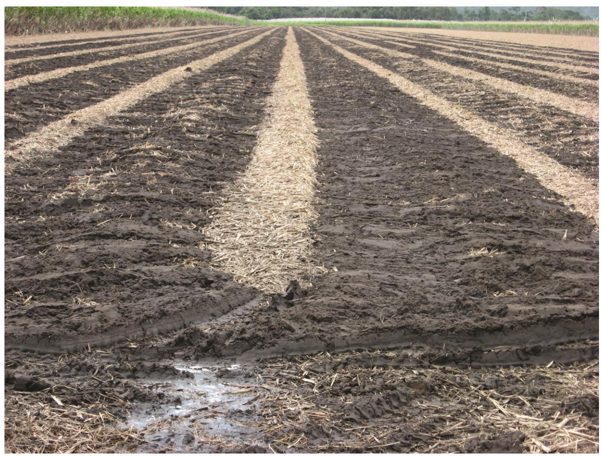
Using mill by-products effectively

FNQ growers in Meringa and Babinda who think mill by-products may be too costly are invited to think again. This workshop will discuss how mill by-products can be effectively used to overcome soil constraints and the opportunities to adjust fertiliser inputs for improved productivity and profitability.