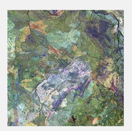
Read more about the Climate Atlas project