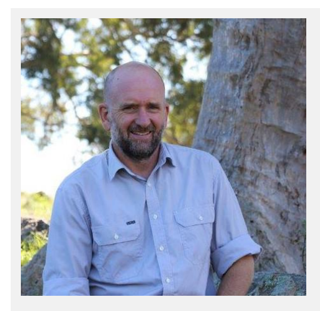
8:00am — 1:30pm, Friday 15 September, 2023