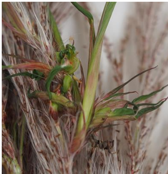
(Above) Smut whip on a cane flower.