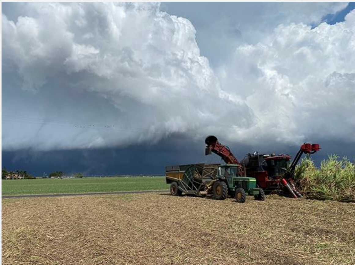
First cyclone of the season moving slowly towards the coast