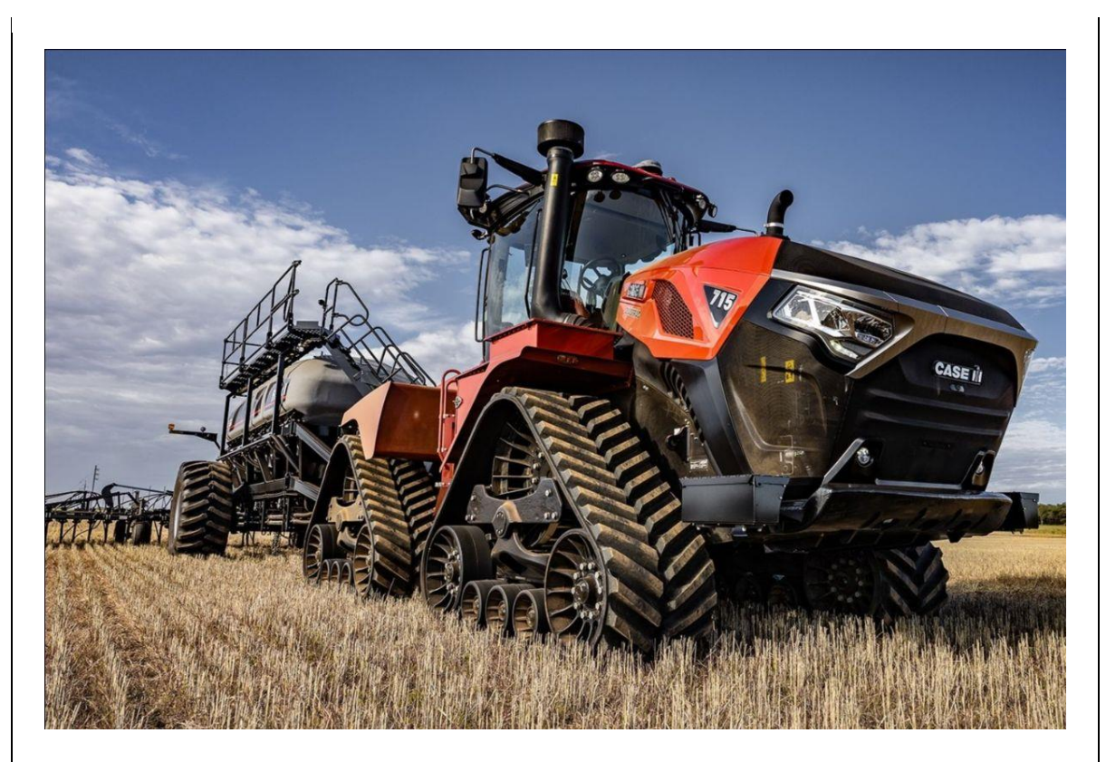
Power, precision and performance highlights of new 715 hp Quadtrac

The Steiger® 715 Quadtrac®, is Case IH's most powerful Steiger ever, and currently the highest horsepower tractor on the Australian market.