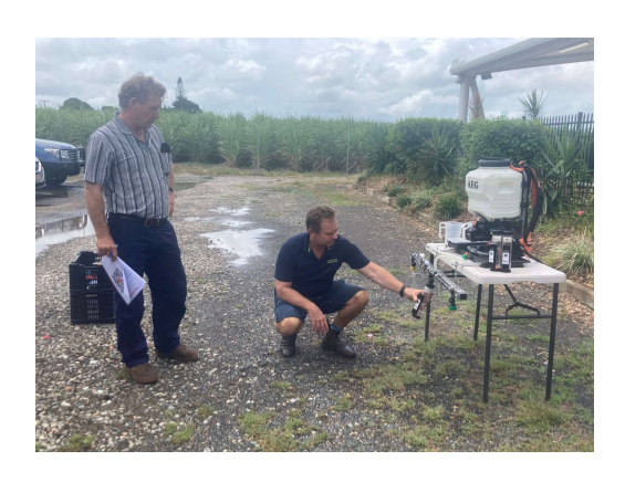
A new training team

The certification includes hands on training and assessment tailored to your industry so that it is as familiar, and useful as possible. During this course you or your staff will (among other things): learn how to use chemicals safely, consider and improve the effectiveness of your spraying, and receive updates on resistance management strategies.